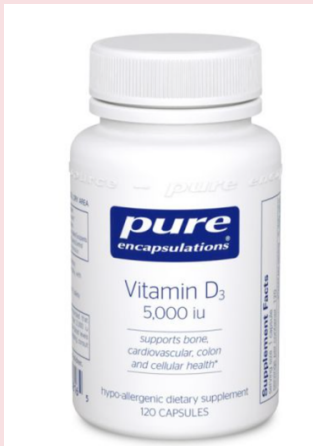
Pure Encapsulations Vit D3 5000