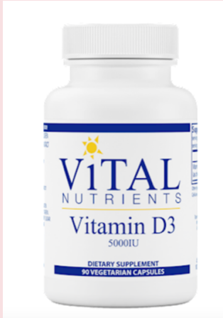
Vital Nutrients D 5,000