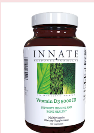
Innate Response D 5,000