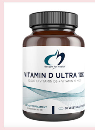
Designs for Health D 10,000 w/K