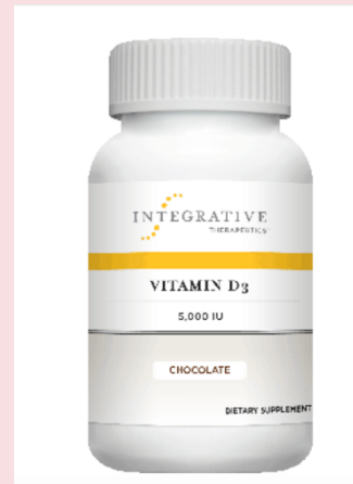
Integrative Therapeutics D 5,000