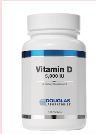
Douglas Laboratories D 5,000